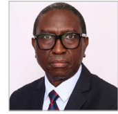
Hon. Peter Chibwe Kapala Minister of Energy Republic of Zambia