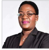
Hon. Kornelia Shilunga Deputy Minister of Mines & Energy Republic of Namibia