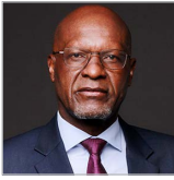
Hon. Tom Alweendo Minister of Mines & Energy Republic of Namibia