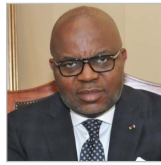
Hon. Bruno Jean Richard Itoua Hon. Minister of Hydrocarbons Republic of Congo