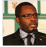
H.E. Gabriel Mbaga Obiang Lima Minister of Mines & Hydrocarbons Republic of Equatorial Guinea