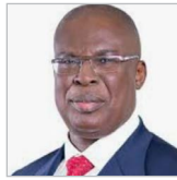
H.E. Chief Timipre Marlin Sylva Minister of State for Petroleum Resources The Republic of Nigeria