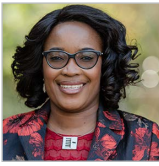
Maggy Shino Petroleum Commissioner Ministry of Mines and Energy